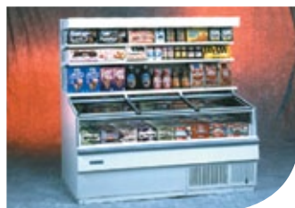
LBN-6 with Optional Superstructure