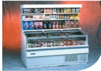
LBN-6 with Optional Superstructure